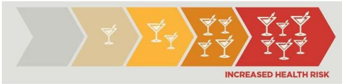
An overview of the dose-dependent health and behavioural impacts of alcohol consumption